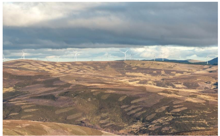
The proposed site, existing view showing Black Hill

Access would be taken from the A941, south of the site. A new junction would allow access up the existing estate track at Redford, which is situated to the east of Upper Cabraon.